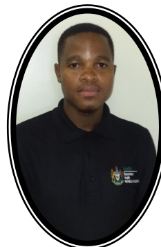
Msimangu Msiziwethu FACILITY